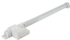
LED 122 Movement Sensor and magnet mount 122040-30