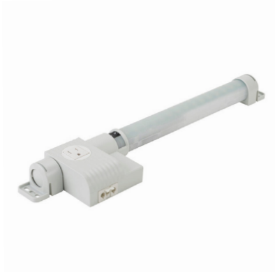
LED 121 On/Off Switch and screw mount 121040-00